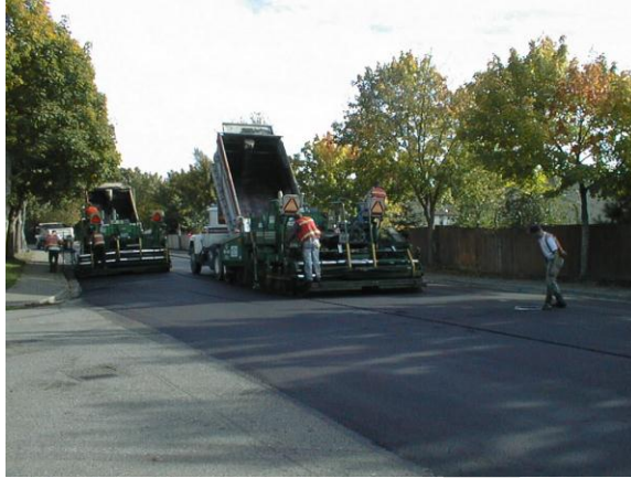
Figure 1. An example of pavement management activities

In addition to resurfacing pavement, upgrading sidewalk curb ramps into compliance with Americans with Disabilities Act (ADA) was included in all resurfacing projects starting in 2007. Although important and necessary, this requirement of upgrading curb ramps has lessened the available funds for resurfacing by about 20%. Also, deteriorated sidewalks, curbs and gutters in poor condition within the overlay project area are also often replaced to achieve efficiency and cost savings. To maintain service levels above a PCI rating of 70 through the year 2030 will require a significant increase in funding.