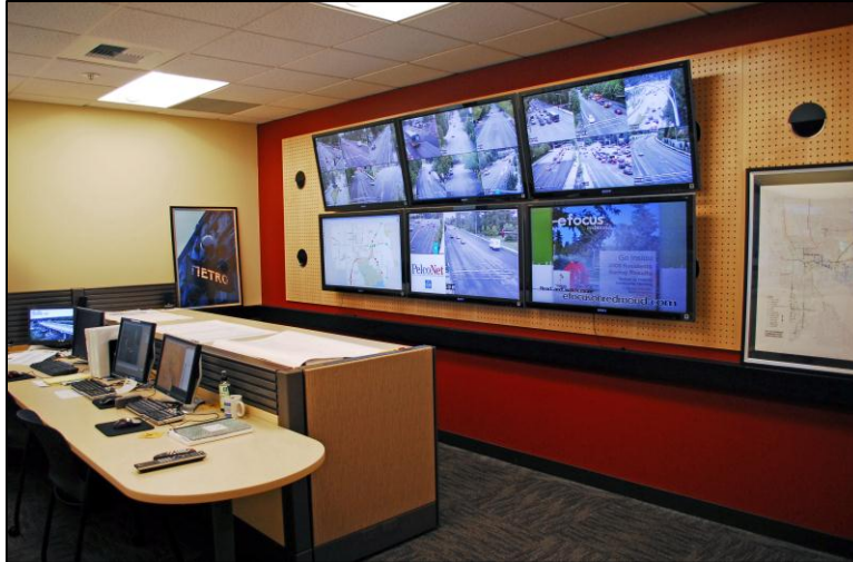
Figure 3. Redmond Traffic Management Center

To improve its ITS as a tool in managing traffic and providing travelers with up-to-date traffic information, Redmond will explore the following: